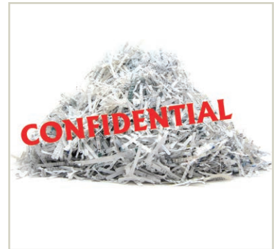
Start your Spring cleaning & bring in documents to shred. At any branch April 15 - May 15.